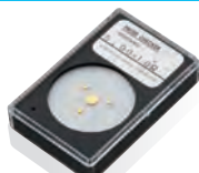
● URS Probe checker MCP-TRURS (RMH327)