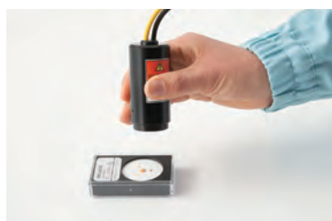
● Validate probe functionality with Probe Checker