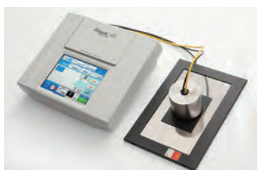
● Stable measurement with Probe Fixer (optional)