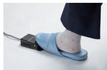
● Foot Switch (optional) enables remote start